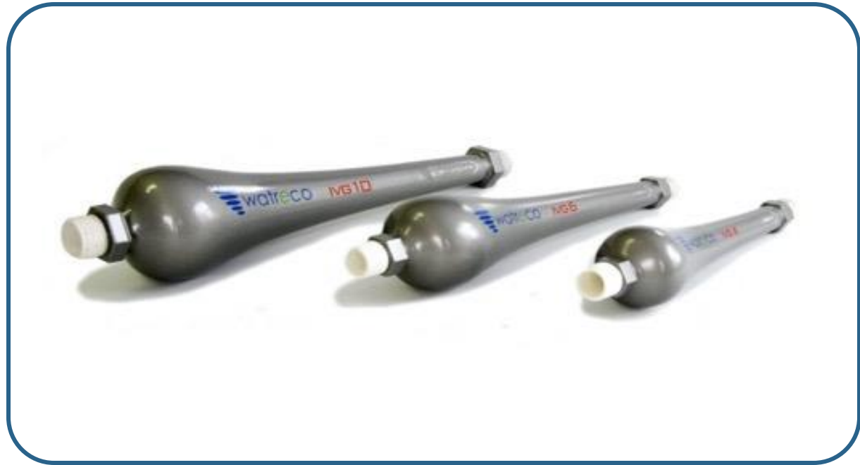
Industrial Vortex Generator IVG