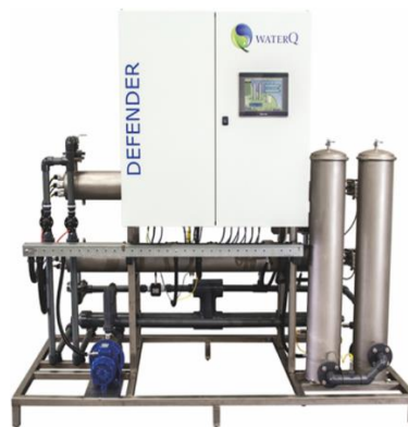
Figure 2. Example of a H 2 O 2 photolysis equipment used for the horticulture irrigation.

Example of a UV/H 2 O 2 photolysis equipment used for the horticulture irrigation.