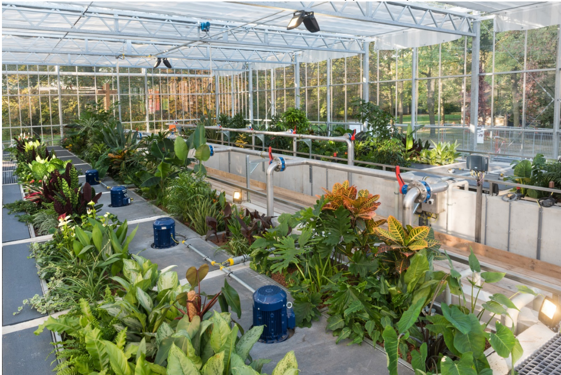
MNR Bioreactors at the La Trappe Abbey